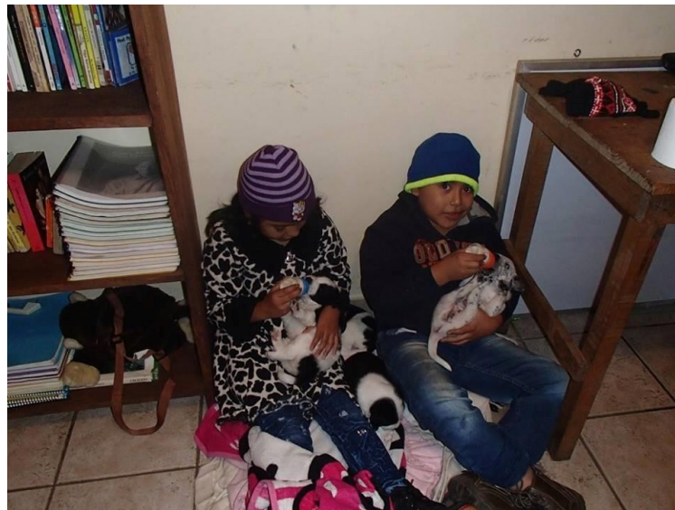
2014-2019: Since we opened our school, we have also been able to rescue and re-home almost 500 street animals.