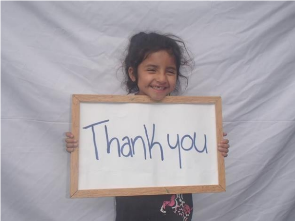
The Integral Heart Family School, Antigua Guatemala

https://www.integralheartfoundation.org/