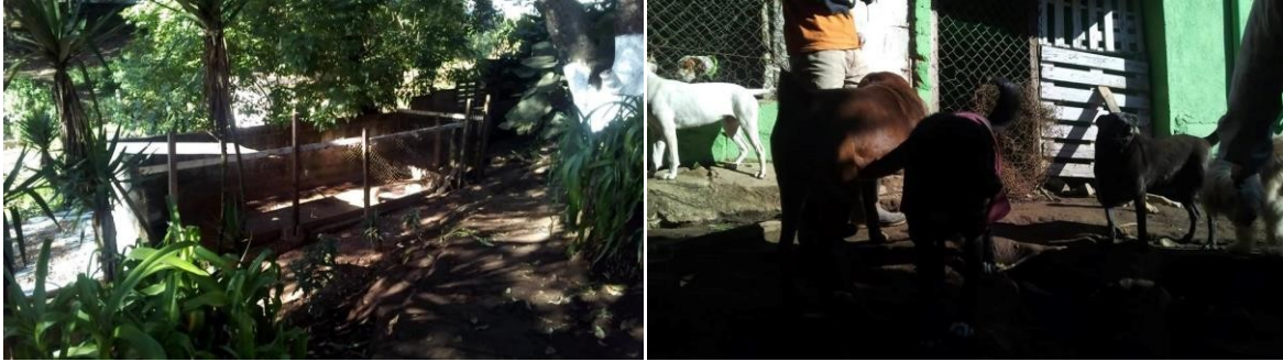
Separate fenced area for difficult or sick dogs.