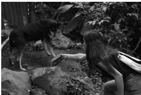
Luring dogs out of their former wild habit.