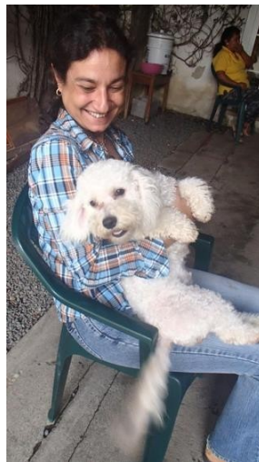
Getting love at our school.