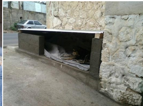
A street dog shelter that we built.