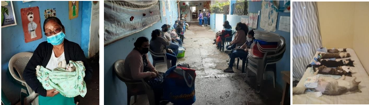
2021/2022: We organized 12 spay and neutering clinics at our school

On-going history of how we got here; In photos: