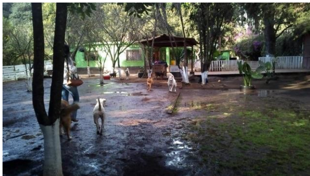
Large run area for bigger breeds.

Below you can see pictures of a local shelter that we support from our personal funds, called Amor Animal, to get an idea of what a shelter in Guatemala looks like. We want to model this and improve on their ideas.