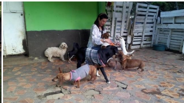
Covered area; this one for small breeds.